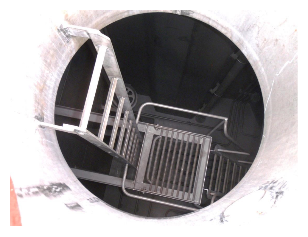
View inside tank showing the "first platform" where the OS was found unconscious.