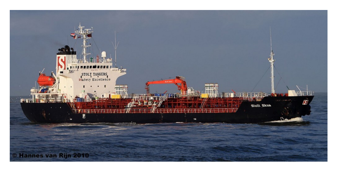
Figure 1: STOLT SKUA

Fatalities in tanks and other enclosed spaces continue to occur at an alarmingly high rate in the maritime industry. The United Kingdom MAIB issued a Safety Bulletin in July 2008 which made recommendations to regulators, ship managers and other industry bodies aimed at improving the identification of potentially dangerous enclosed spaces and the identification of measures to reduce this unnecessary loss of life. No further recommendations have been made in this report.