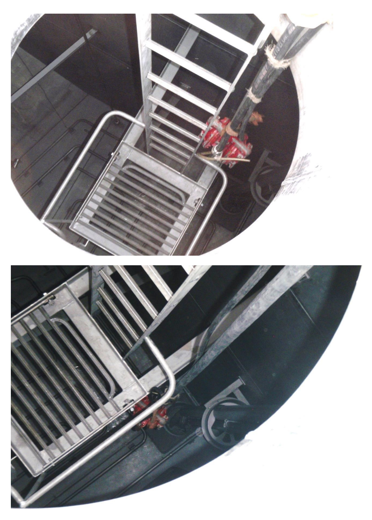
Lowering a "Wilden Pump" into the cargo tank to eject any remaining tank washings.