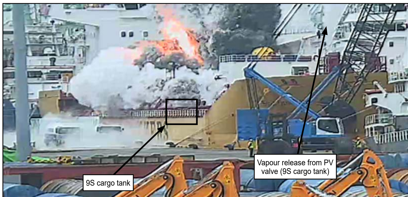
Figure 1: Tank rupture and ignition of released vapour

At 1043, vapour started to release from the pressure vacuum valve for Stolt Groenland's number 9 starboard (9S) cargo tank, which contained styrene monomer. About 2 minutes later, a high-level alarm indicated that the level in 9S cargo tank had reached 95%, soon followed by a high-high-level alarm indicating that the level had increased to 98%. By now, Stolt Groenland's on-watch deck officer and chief officer had made their way to the cargo control room and they saw from the cargo monitoring system that the pressure inside 9S cargo tank was rapidly rising. Suddenly, at 1050, two explosions were seen and heard in rapid succession in way of the tanker's cargo manifold ( Figure 1 ). The resulting fireball passed very close to a road bridge above the quay ( Figure 2 ).