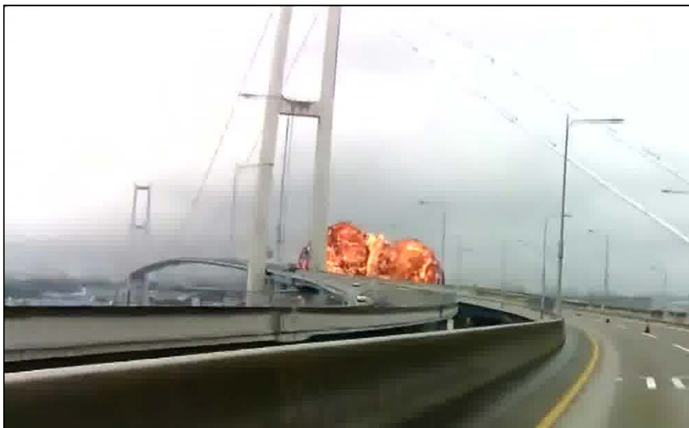
Figure 2: Fireball viewed from the Ulsan bridge