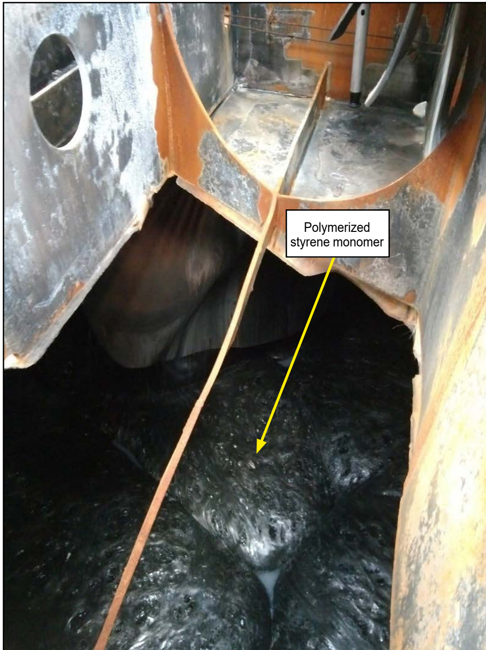
Figure 4: 9S tank rupture

The explosions on board Stolt Groenland were probably caused by the rupture of the deck above 9S cargo tank, followed immediately by the ignition of the styrene monomer vapour that was then released. The rupture was due to over-pressurisation and the likely sources of the ignition were static electricity, sparks or elevated steel deck plate temperatures resulting from the tank rupture. A large hole was found in way of the tank's common bulkhead with number 9 centre (9C) cargo tank ( Figure 4 ) and its hatch cover had been blown off. No cargo operations or deck maintenance were in progress at the time. VDR data showed that the temperature of the styrene monomer had reached 100°C at the time of the explosion. Such an elevated temperature indicates that the cargo was polymerizing.